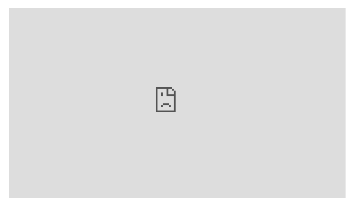
Listen to Seymour Hersh leaked audio:

(full transcription here and extended audio of the Hersh conversation here )